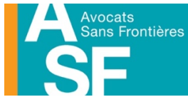
Avocats Sans Frontières / Lawyers Without Borders