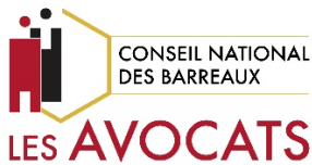
Conseil National des Barreaux les Avocats – National Bar Council of France / France