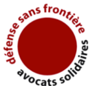
Défense Sans Frontière-Avocats Solidaires / France